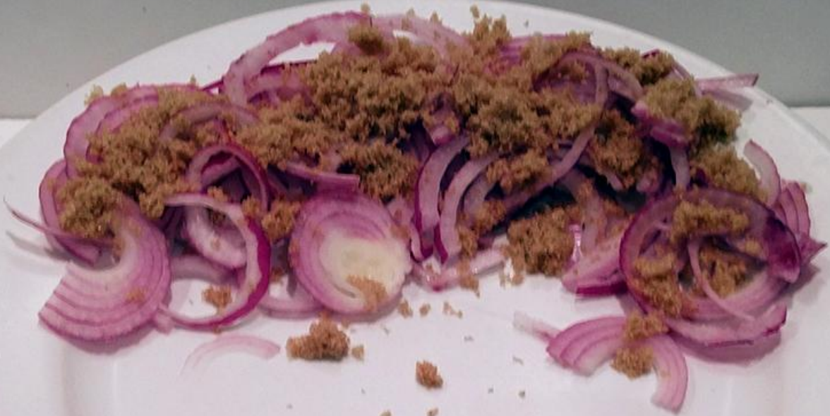
Onion and Brown Sugar Syrup